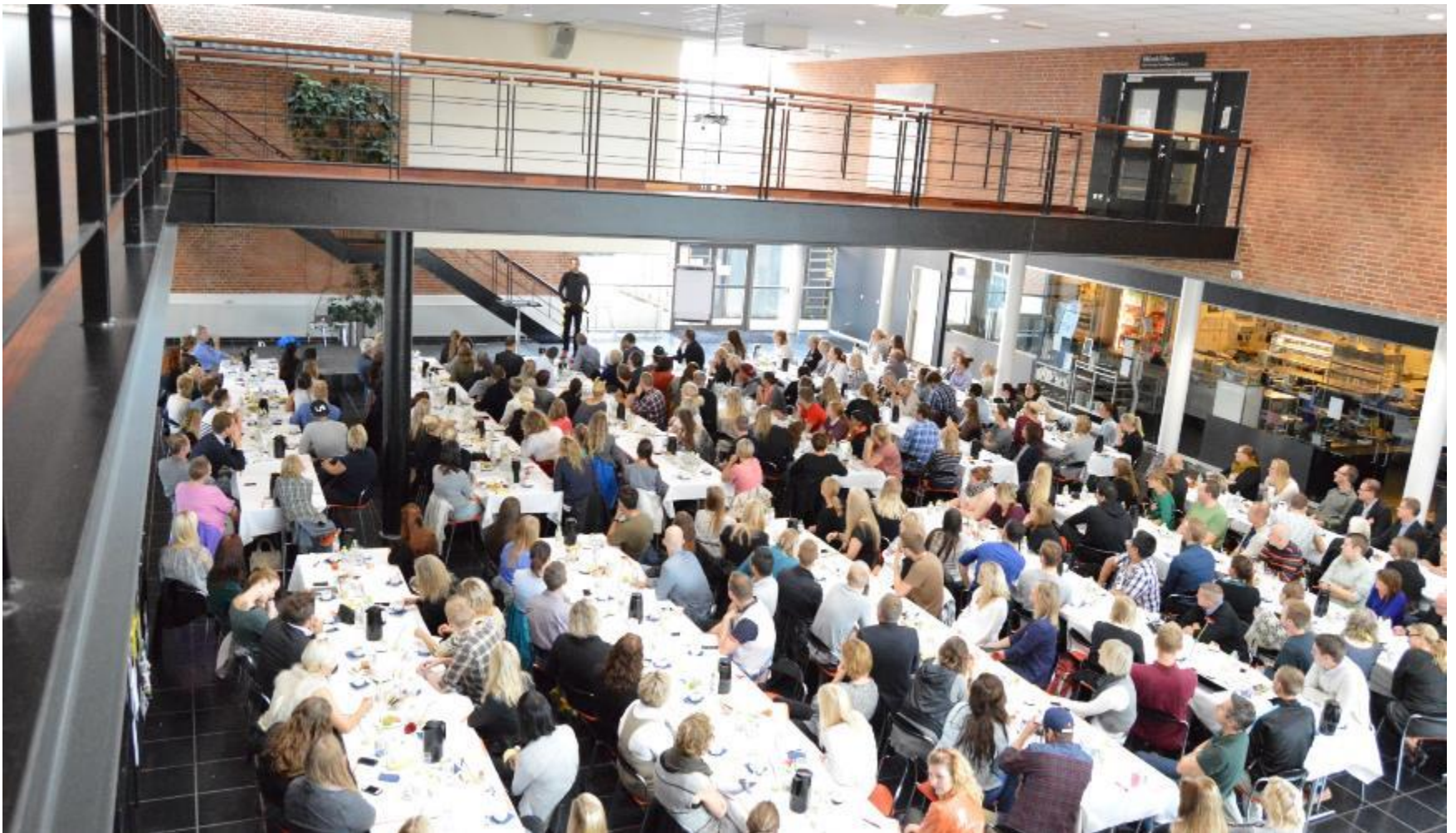
An event at the main campus canteen