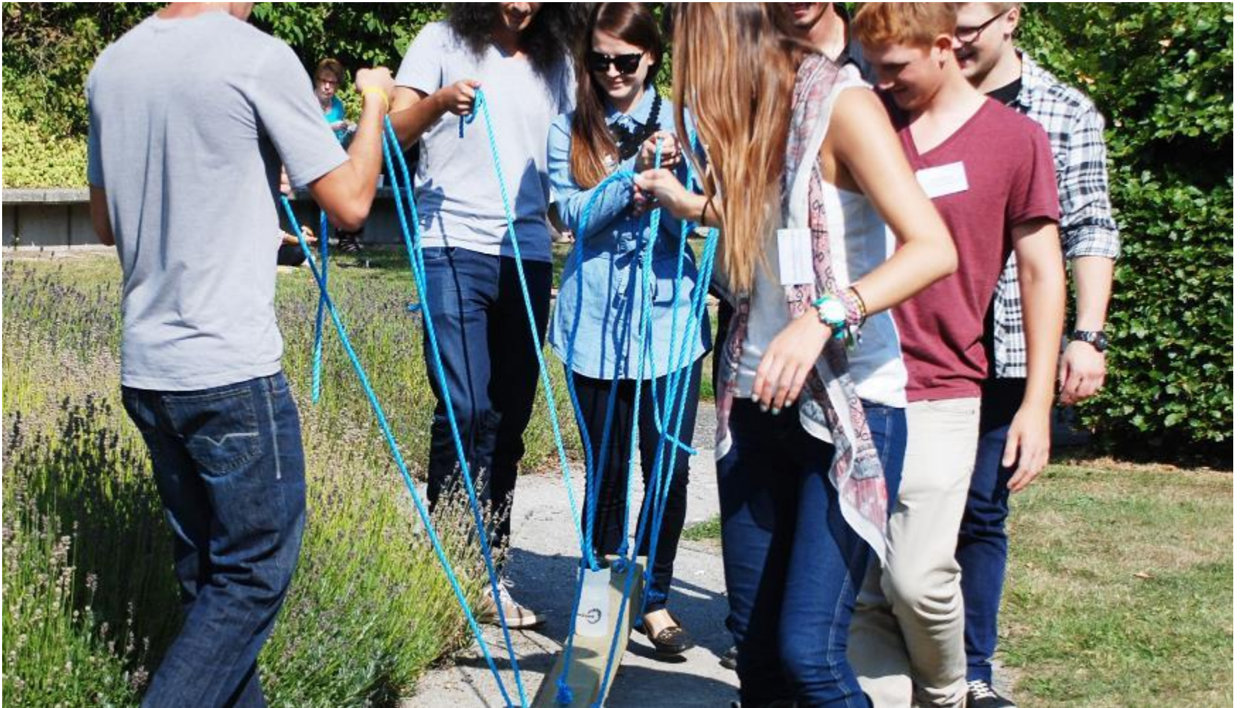
Team building during Orientation Day