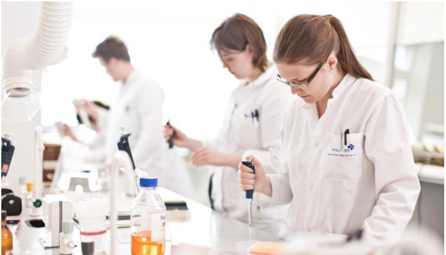
At the laboratory