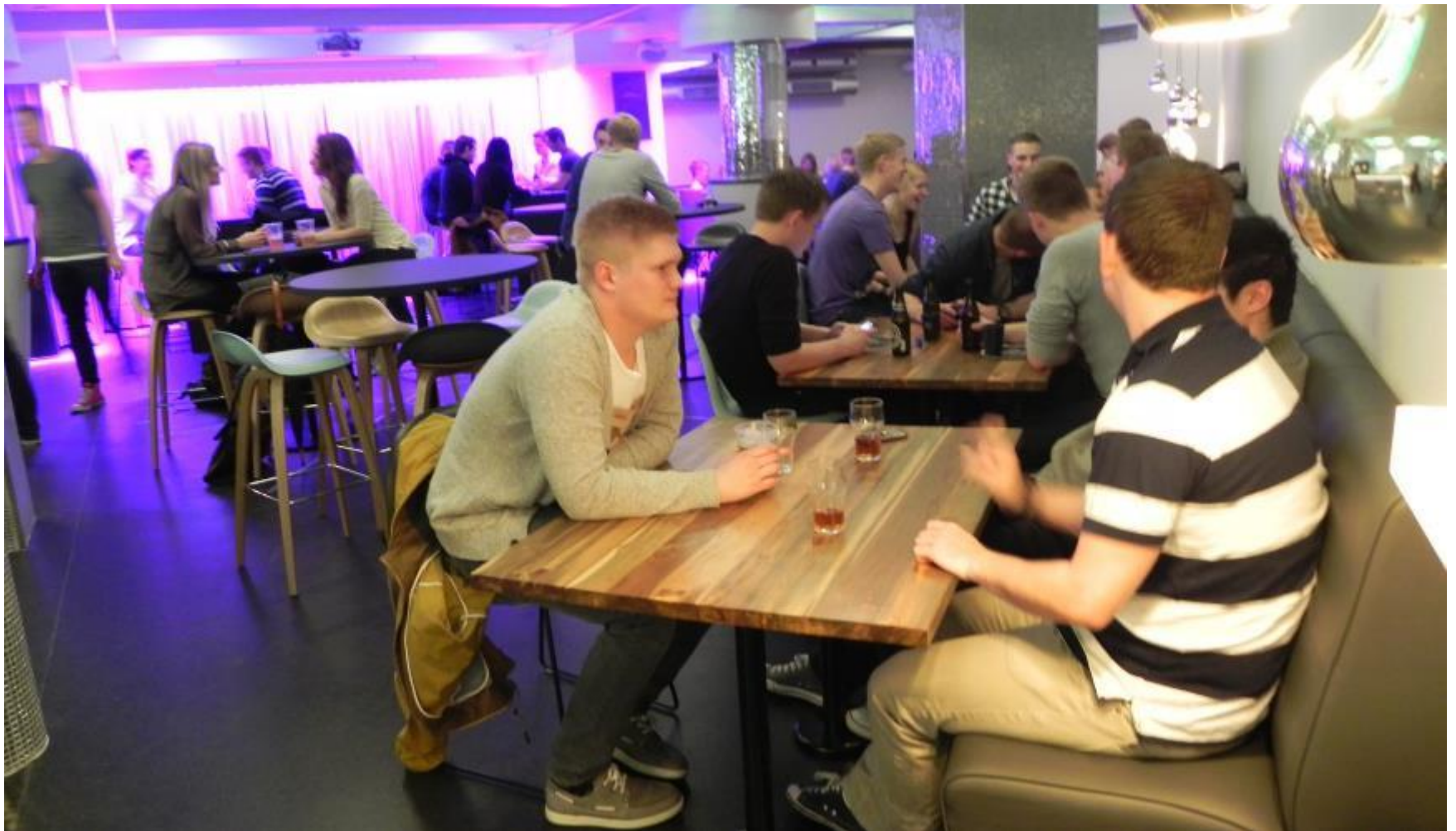
The BAAA bar 'Basement'