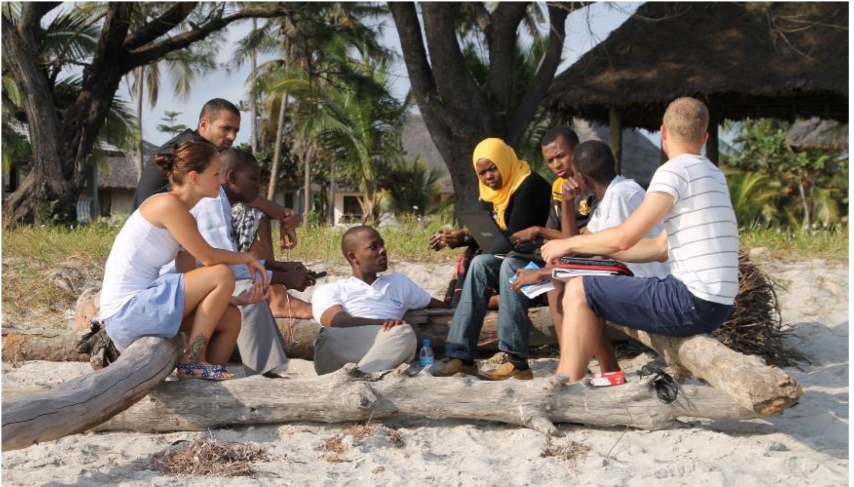
Summer school in Tanzania