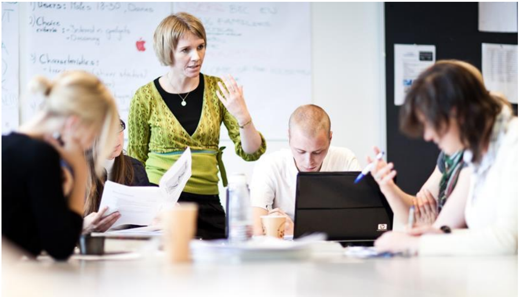
A teaching situation