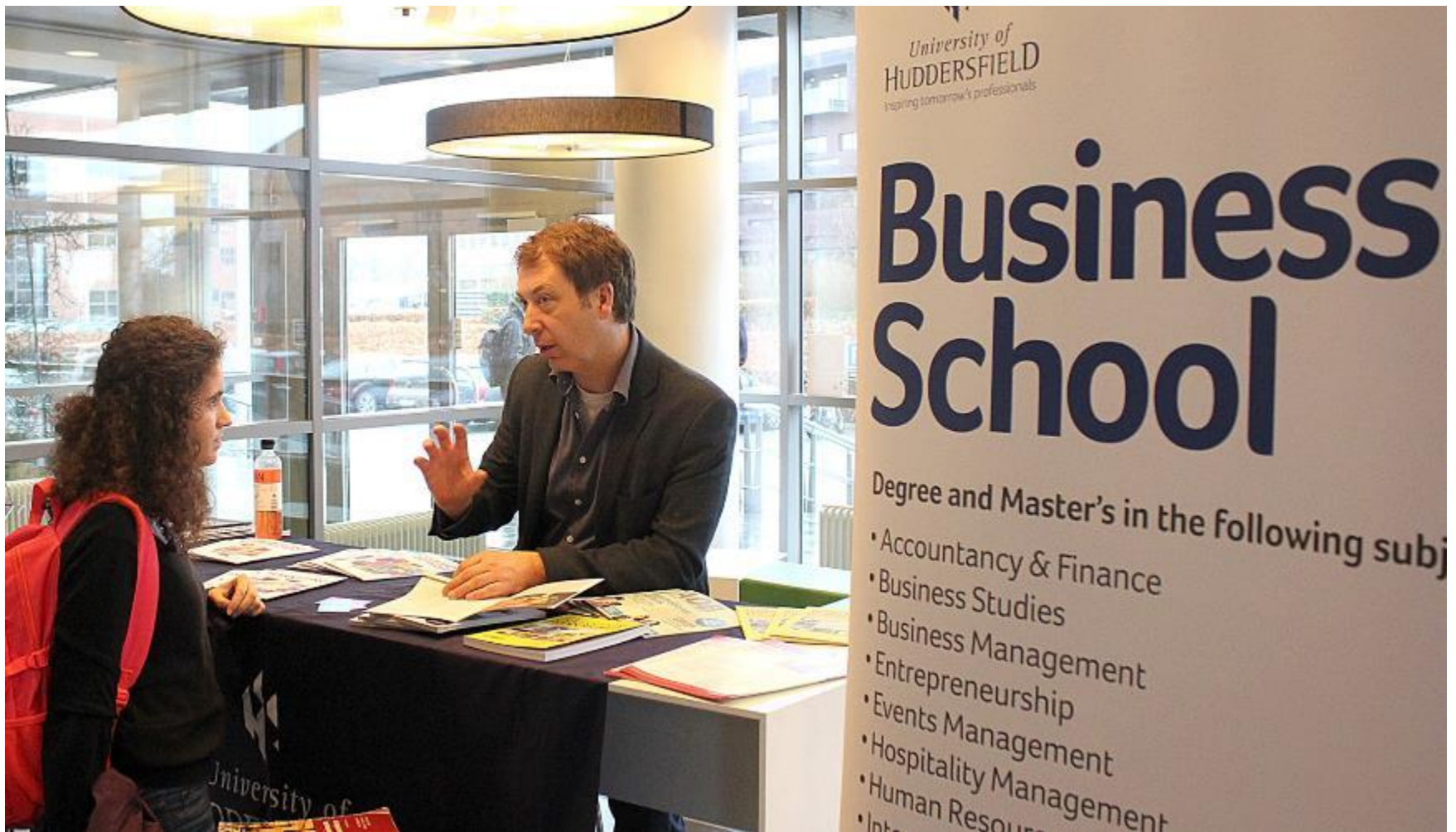
Further Studies Day