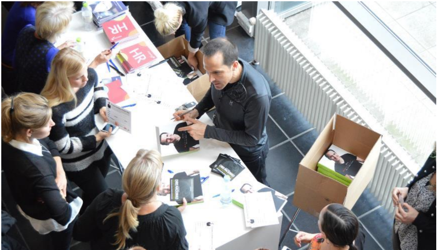
Event for alumni and students with EAlumne (BAAA's Alumni network)