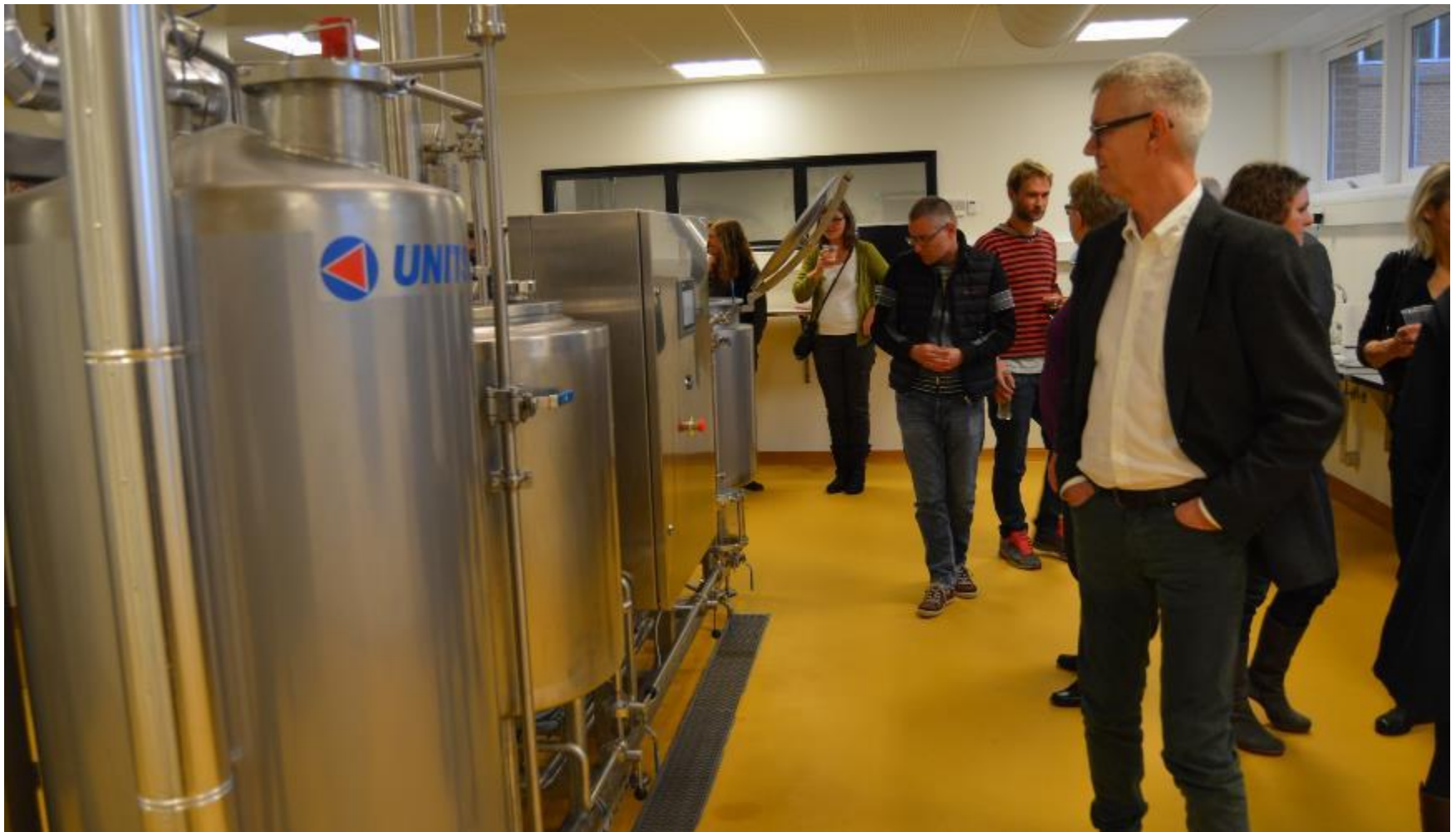
The BAAA brewery