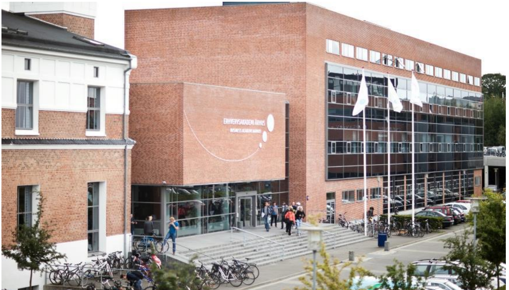
BAAA main campus