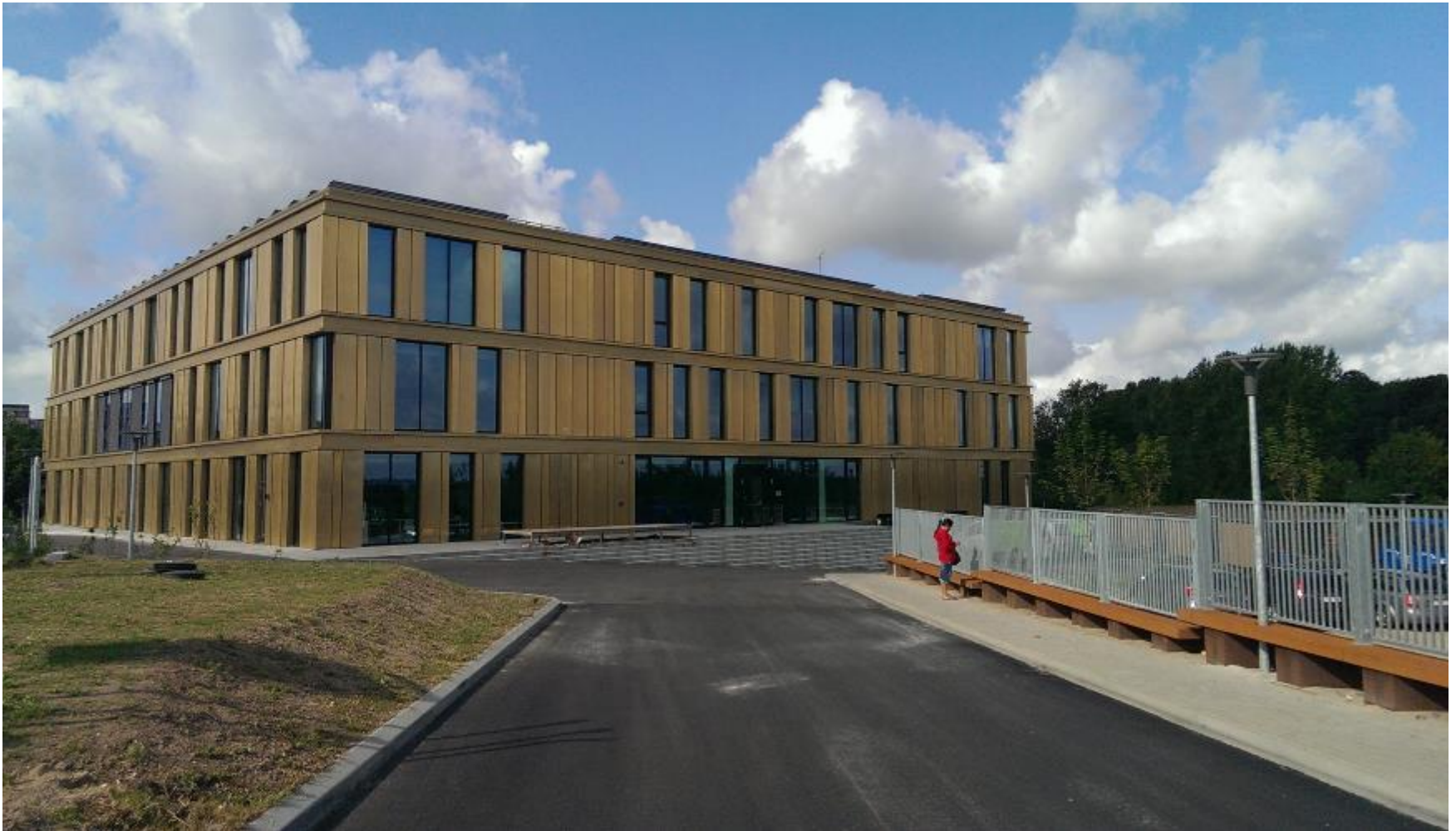
BAAA's new building for Web, Media and Communication students